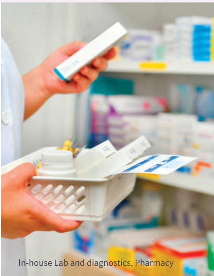
In-house Lab and diagnostics, Pharmacy

200+ In-house consultants only for women and children Cumulative 2000+ years of average experience of doctors